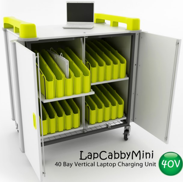
LapCabbyMini 40 Bay Vertical Laptop Charging Unit 40V