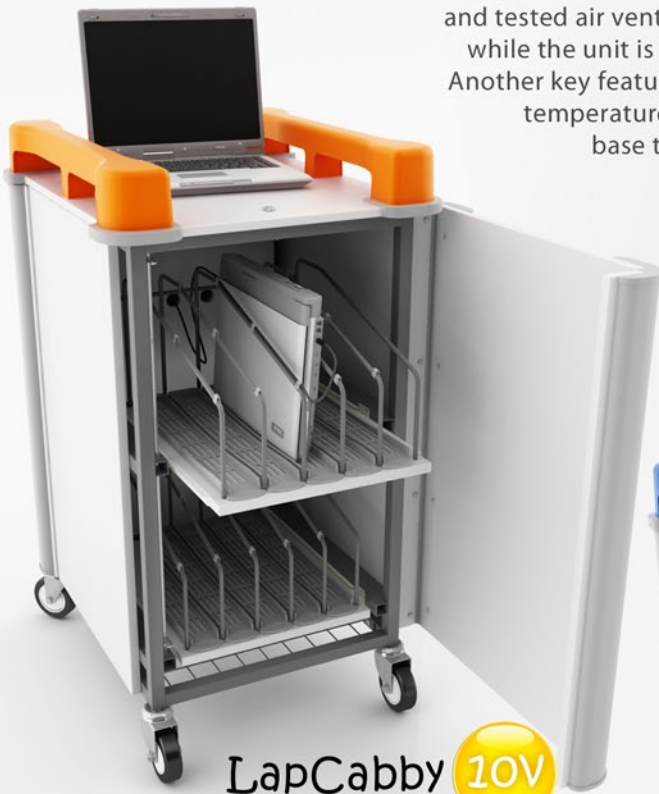
LapCabby 10V 10 Bay Vertical Laptop Charging Unit