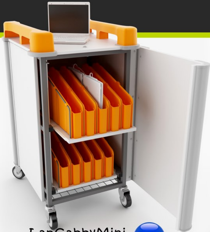
LapCabbyMini 20 Bay Vertical Laptop Charging Unit 20V