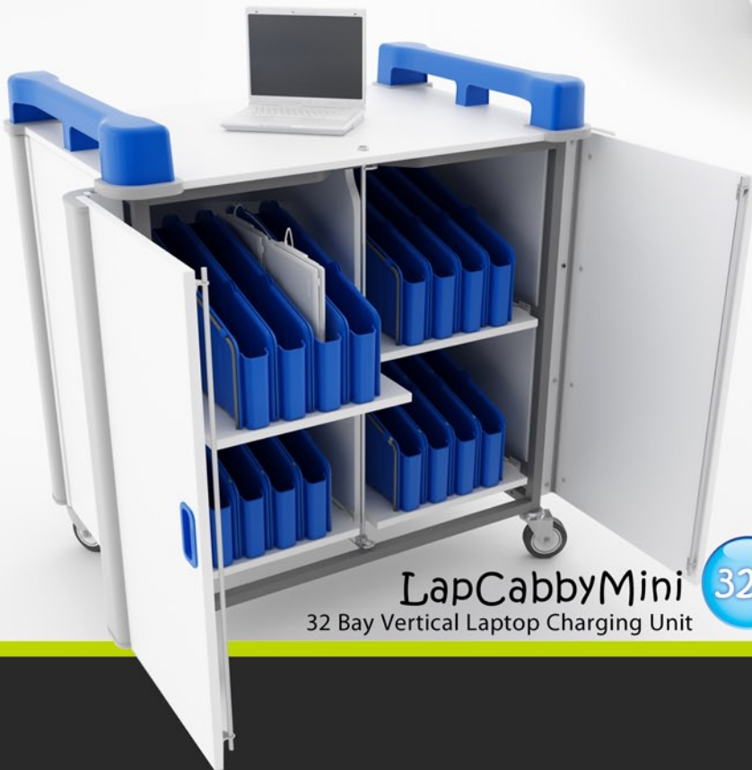
LapCabbyMini 32 Bay Vertical Laptop Charging Unit 32V