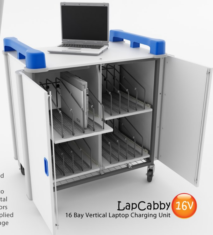
LapCabby 16V 16 Bay Vertical Laptop Charging Unit