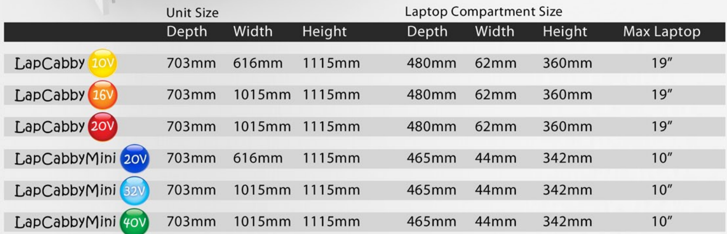
LapCabby 20V 20 Bay Vertical Laptop Charging Unit

Individual laptop storage boxes to keep your laptops protected from knocks and scrapes (shown here carrying two mini-laptops) are available as an optional extra on regular LapCabby Vertical Storage units. Boxes are standard on all LapCabby Mini's.